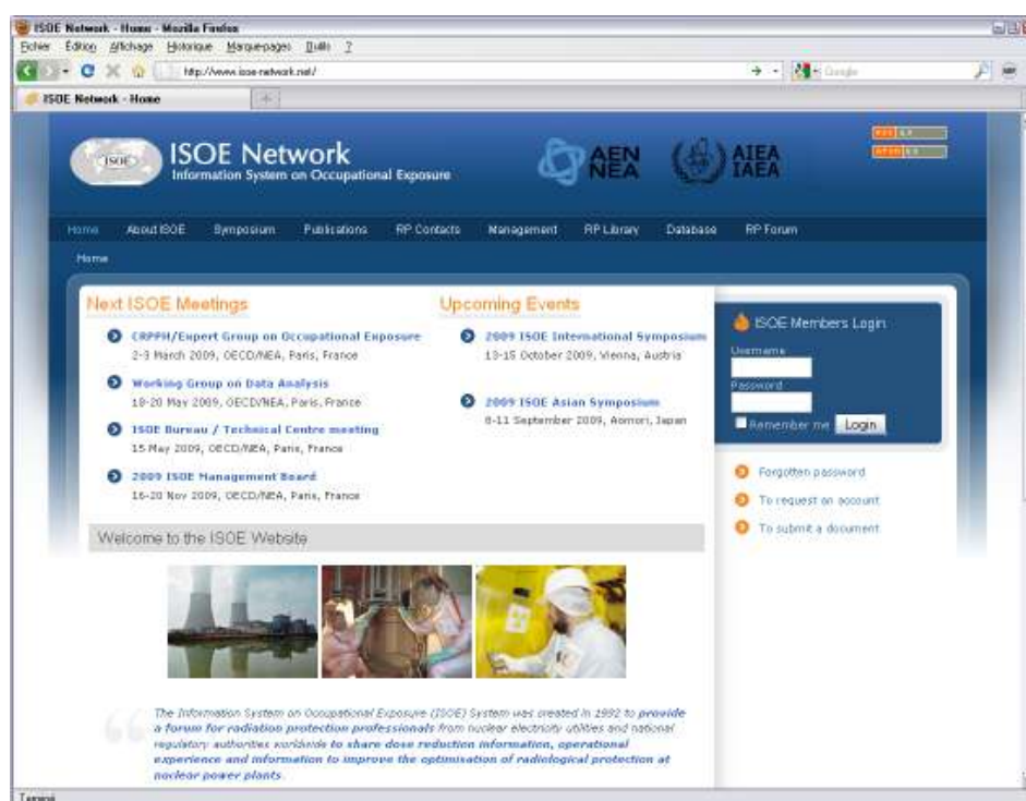
Figure 3: Homepage of the updated ISOE Network ( www.isoe-network.net )

Using a simple web-browser in combination with an assigned user name and password, members can access the ISOE database through the internet. The implementation of the web-enabled ISOE database and benchmarking/analysis software on the ISOE Network has been an important step forward in improving participants' accessibility to the ISOE data for use in their daily management of worker doses. In 2009, the data entry modules will be implemented, allowing participants to enter their occupational exposure directly through the website. While the CD-ROM version of the ISOE database continues to be produced and distributed annually, the web-enabled version is intended to serve as the main data entry, access and analyse application for ISOE participants.